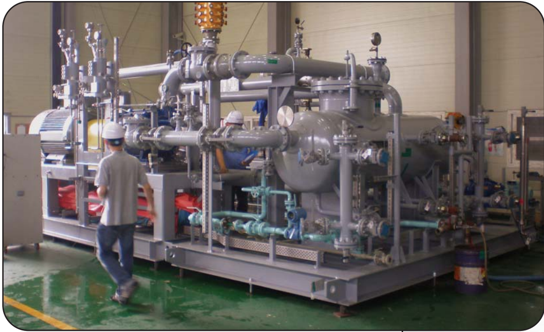
Vapor Recovery System for FPSO