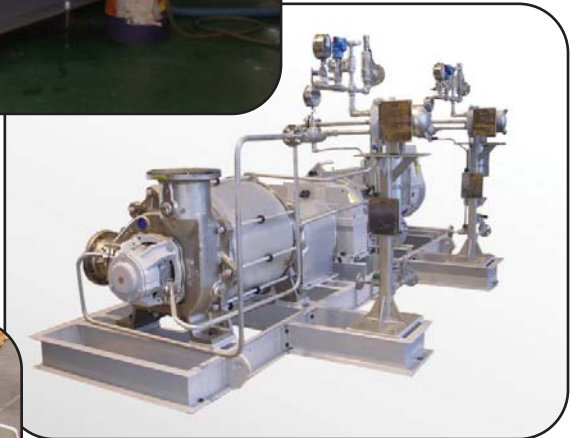
System for crude tower distillation