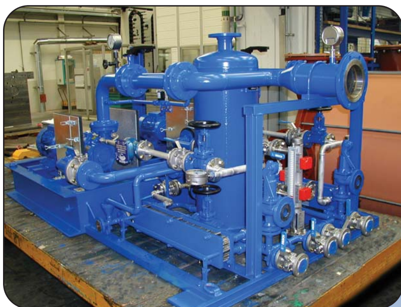
Duplex package for a chemical plant

Gardner Denver Nash has expertise beyond liquid ring pumps and compressors. We use our 100+ years of experience and create the best, most energy efficient system available for your application and to your specifications. See some of our packages below.