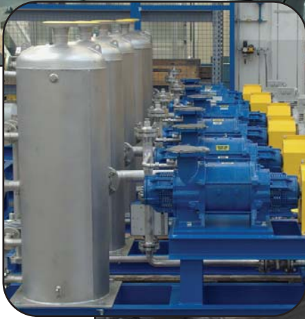
XL45 packages for evaporator milk service in Thailand